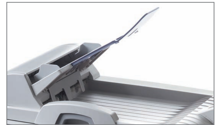
Standard 50-sheet AUTOMATIC DOCUMENT FEEDER (ADF)