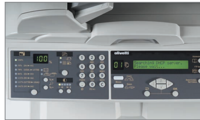
Intuitive OPERATOR PANEL for copy production and full scanning power in network environments